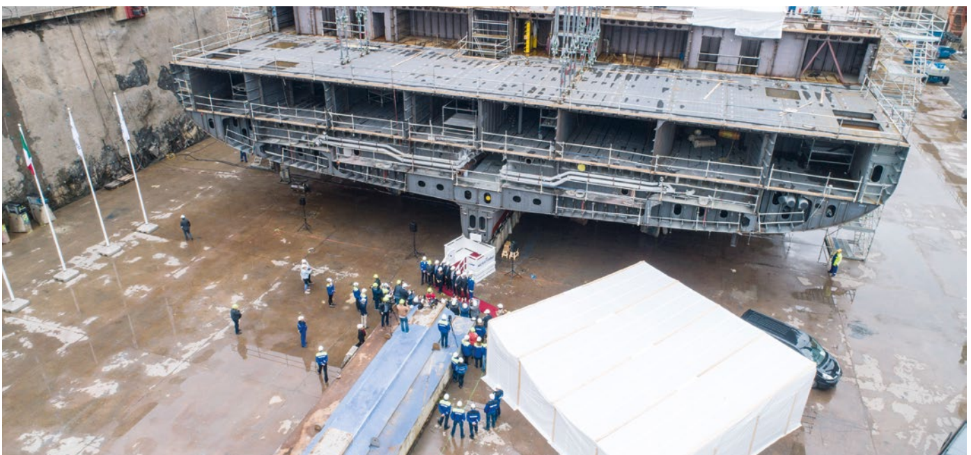
In contrast to the roofed dock in Papenburg, the cruise ships are constructed in full length – from tank to observation deck – in the open docks in Turku.

Converting the outfitting components from Catia V4 to CADMATIC was even more challenging than converting the ship's hull. Given the different system philosophies of the two CAD systems, it was not possible to simply convert the CATIA geometry. Instead, the component IDs, their