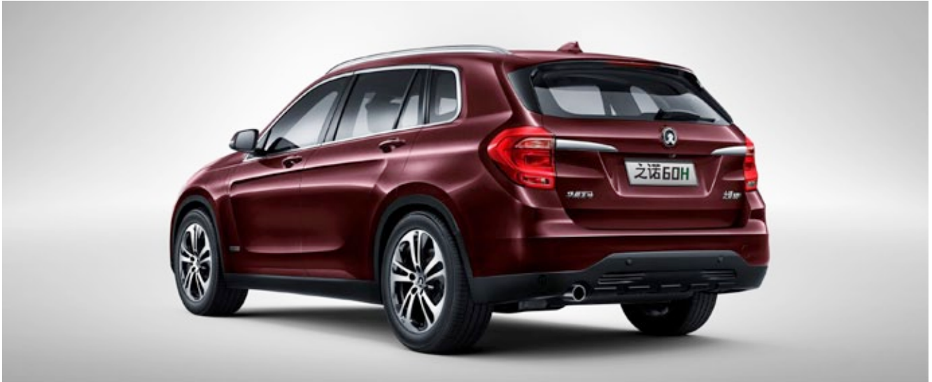
BBA uses the PLM system Teamcenter from Siemens in combination with CATIA V5 as the backbone for managing geometry data.

usage of the web interface is very important to ensure a high level of acceptance of the solution, not only in the business departments at BBA, but also at the external partners.