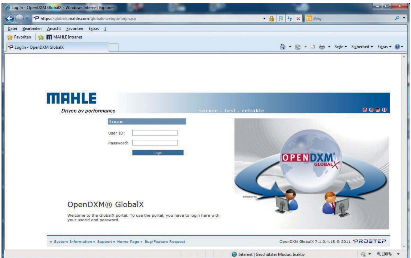
The OpenDXM GlobalX web-based data exchange portal permits the fast, secure and reliable exchange of large data quantities over the Internet.

From the very outset, one important requirement was to be able to automate not only outbound data transfer but also import operations. Here, the most important capabilities were to log data reception, identify the recipient, automatically forward the data to the inbound folder for the relevant busi-