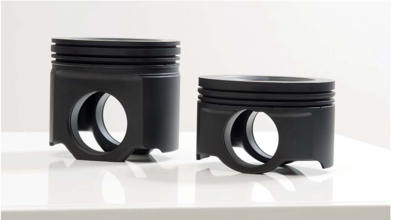
Mahle is one of the world's three largest suppliers of piston systems, cylinder components and systems for valve trains and air and liquid management.

ness unit, and inform recipients that data was available for them. Wickom: „Back then, PROSTEP developed this functionality, which now forms part of the standard scope, specifically in line with our requirements.“ At Mahle, the data is not checked in directly in SAP PLM because users should first validate the quality of the inbound data. In addition, the data volumes received from the OEMs are sometimes extremely large, for example for a complete vehicle front section. In such cases, only the relevant connection geometries are to be made available in the PLM context.